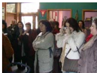
PECERA participants photograph the photographer!

PECERA (established in 2000) aims to foster high quality research and to link research and practice in early childhood education in the Pacific region.