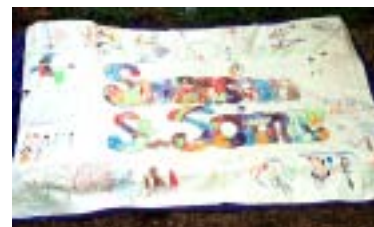
The Swanston St. Science banner – made by Swanston St. children.

CEIEC Conference supplement 5-10 Program 6