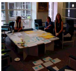
Equity Adventures - the CD rom in the making

"Equity Adventure" users can familiarize themselves with key approaches to equity issues in early childhood education."