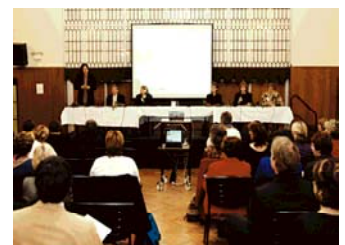
The panel 'Raising children free from violence' at the inaugural conference